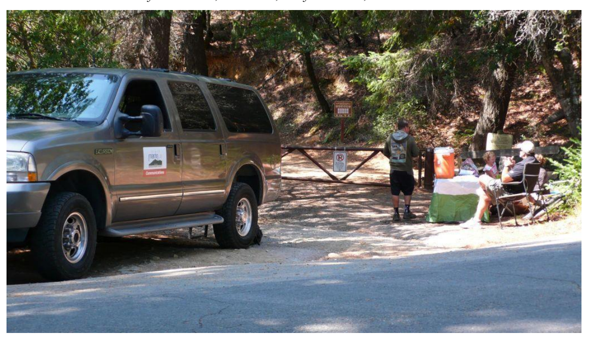
East Peak water stop- Doug Slusher, KF6AKU